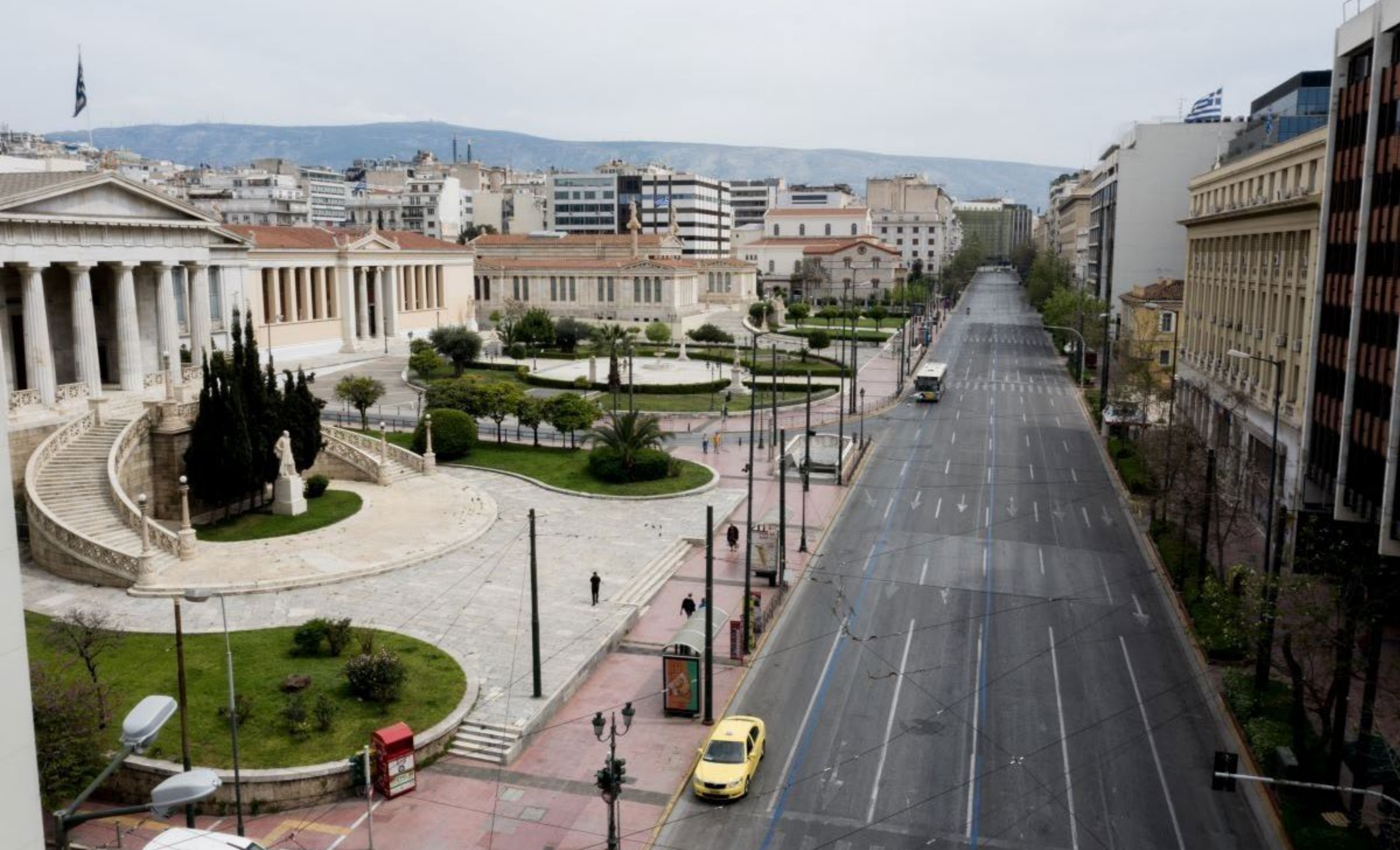
PANEPISTIMIOU AVENUE, ATHENS